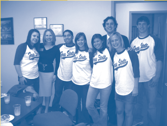
KU Credit Union sponsored the “Homestretch Senior Transition” workshop for Lawrence Free State High School students.