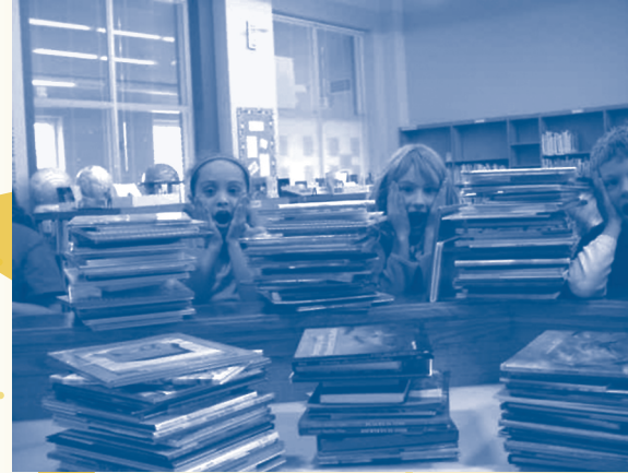
Altrusa Club of Lawrence donated $4,000 in books to New York Elementary School's library.